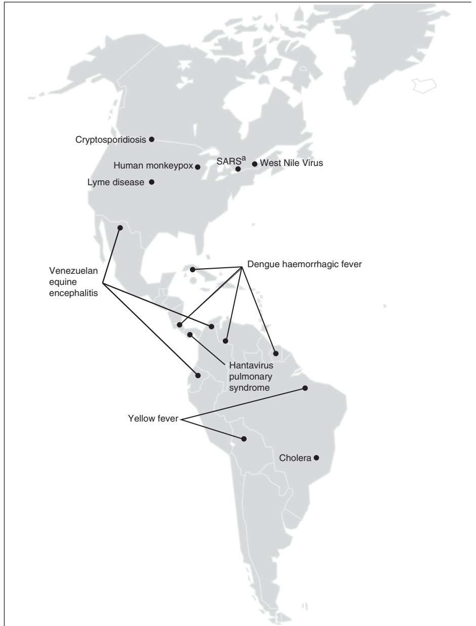
Figure 1: Selected Emerging Infectious Diseases, 1996-2004