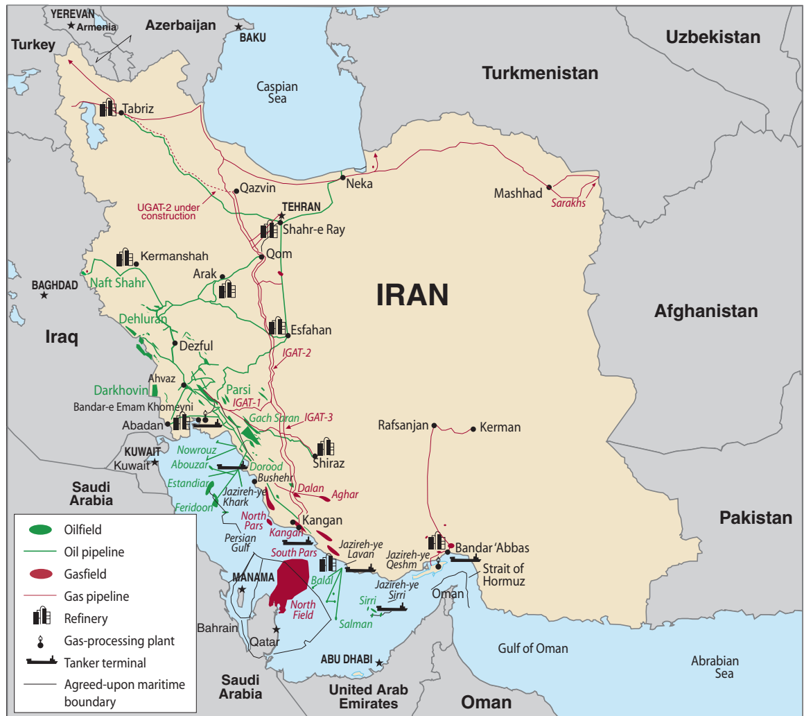
Figure 1: Map of Iranian Oil, Gas, and Petrochemical Activities