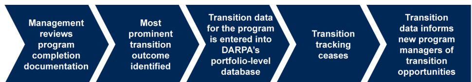
Figure 2: DARPA Process for Assessing Technology Transition Outcomes

Source: GAO analysis of Defense Advanced Research Projects Agency (DARPA) information. | GAO-16-5