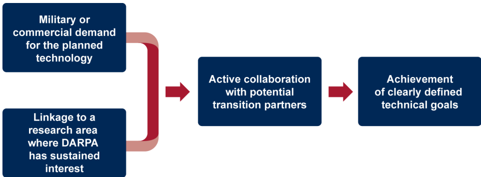
Figure 3: Several Factors Contributed to Successful Technology Transition in Selected DARPA Programs

Source: GAO analysis of Defense Advanced Research Projects Agency (DARPA) information. | GAO-16-5