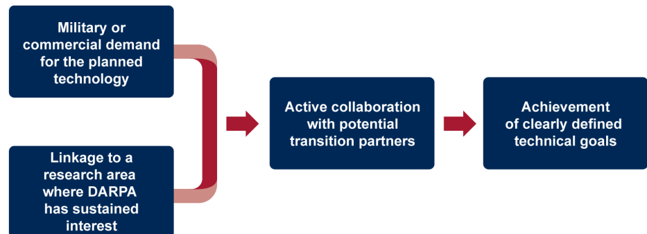
Factors That Contributed to Successful Technology Transition in Selected DARPA Programs

Source: GAO analysis of Defense Advanced Research Projects Agency (DARPA) information. | GAO-16-5